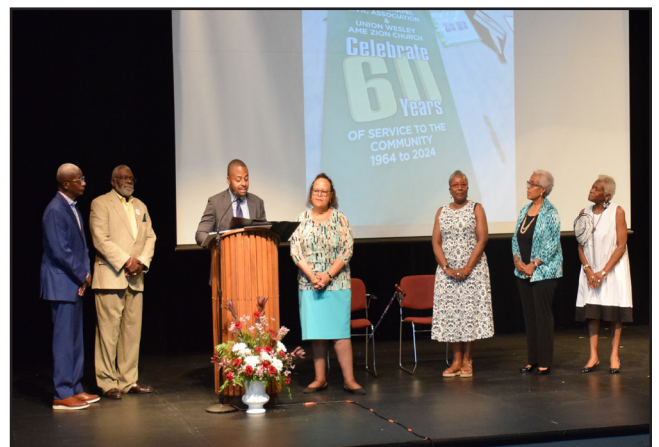
Queens Chapel Civic Association 60th Anniversary